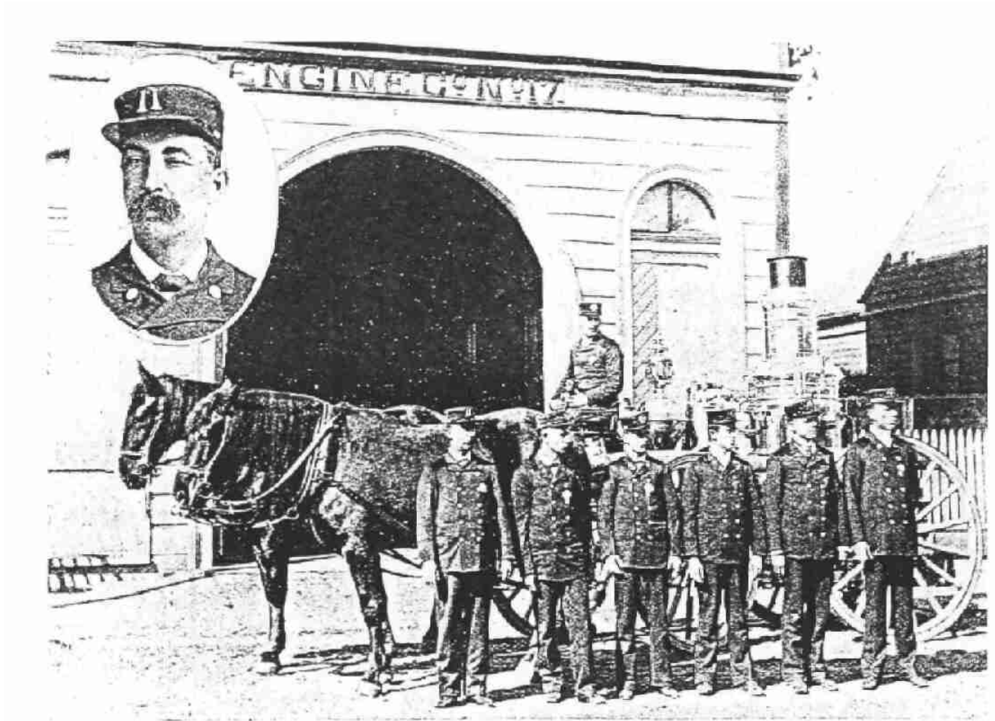
ENGINE Co. No. 17.