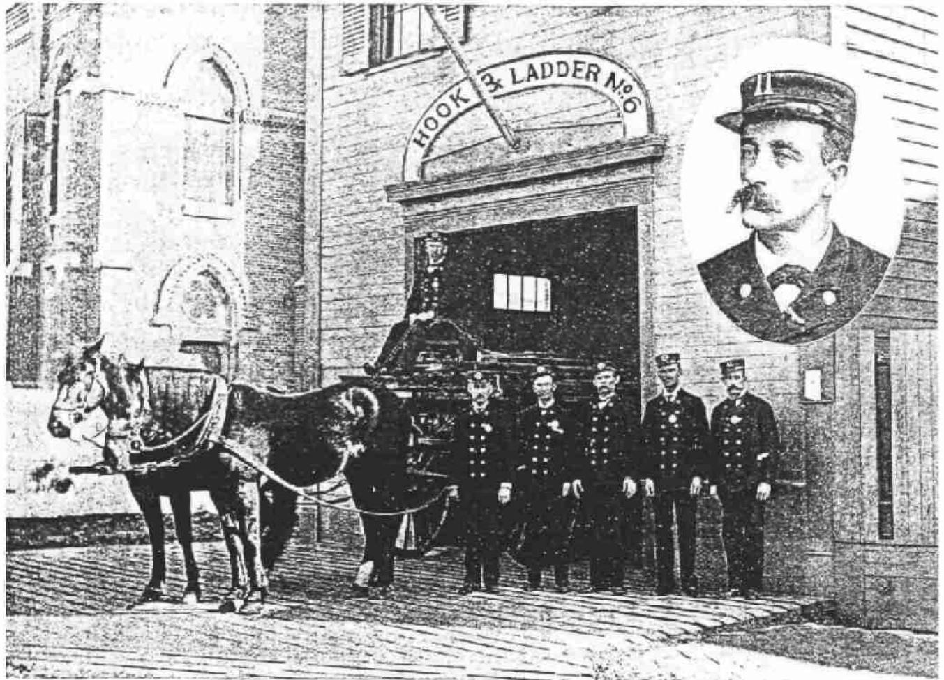
Hook & Ladder Co. No. 6.